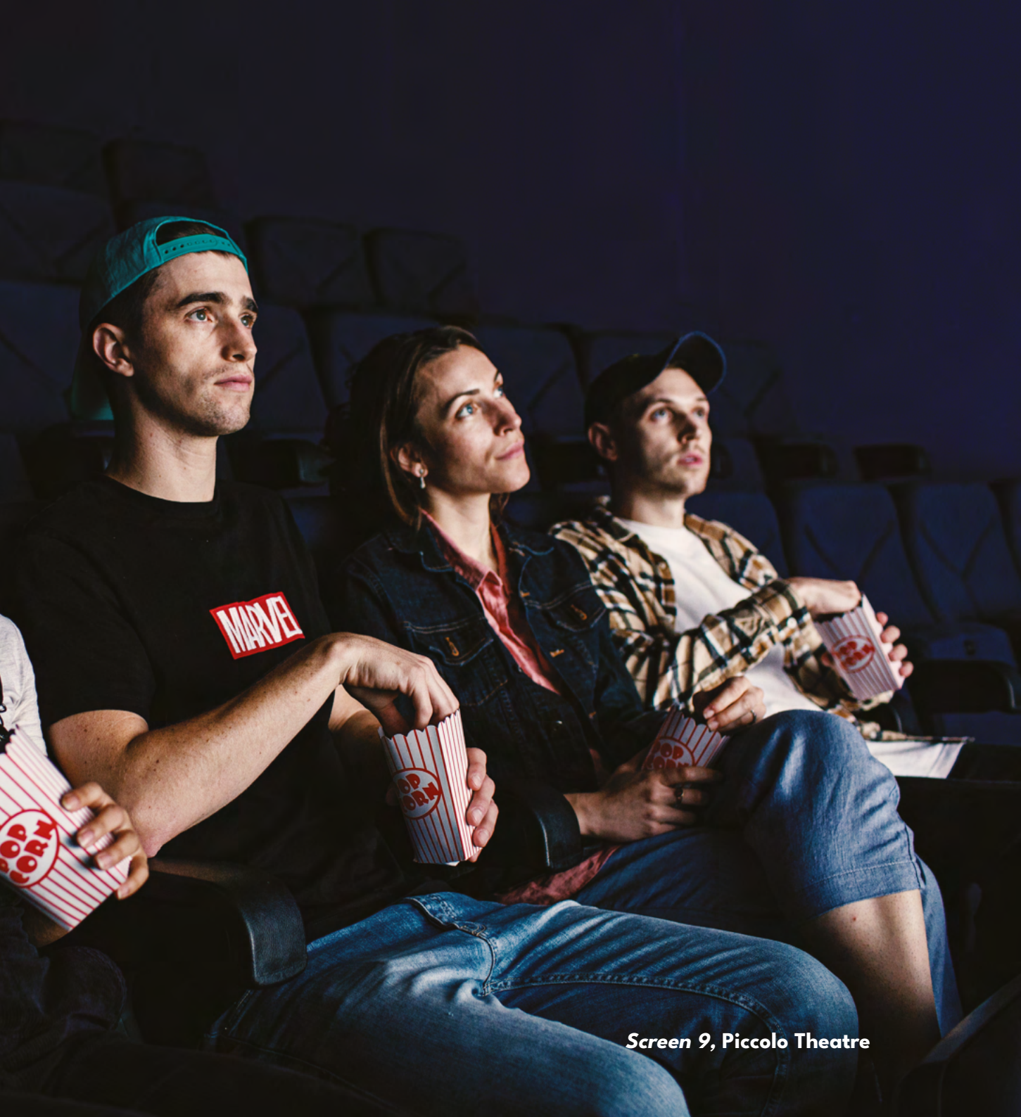
Screen 9, Piccolo Theatre