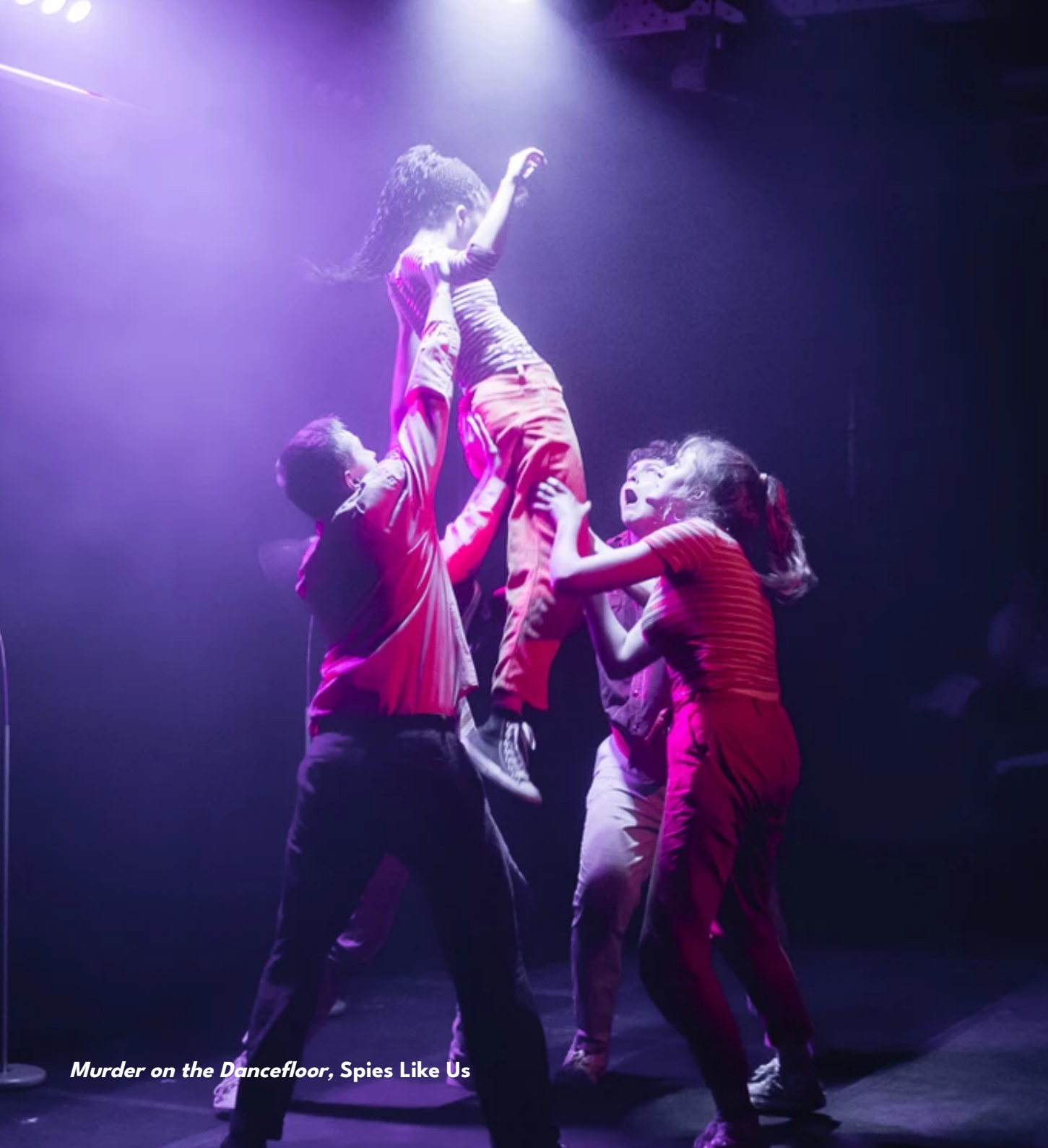
Murder on the Dancefloor, Spies Like Us

“To have had the opportunity to kickstart our careers and our company at such a prestigious venue and with such invaluable support is a huge privilege and something to which we will always be indebted.”